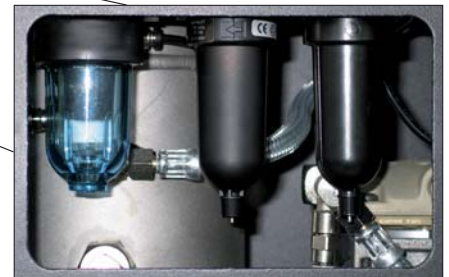
Baby Mamba only