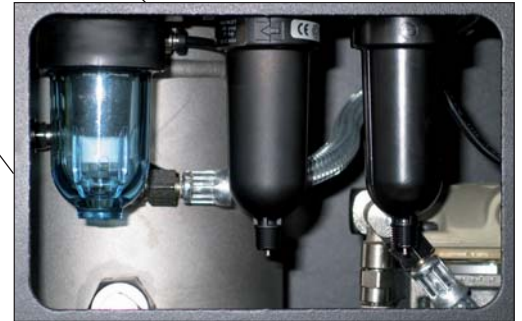
Black Widow only