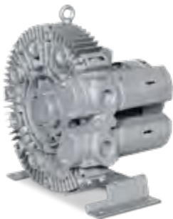
G-BH7 single stage