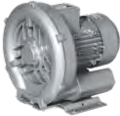
G-BH1 single stage