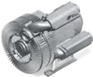
G-BH2 VELOCIS single, double and triple stage