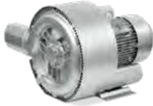
G-BH1 double stage