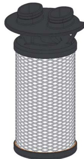
Depth filter A