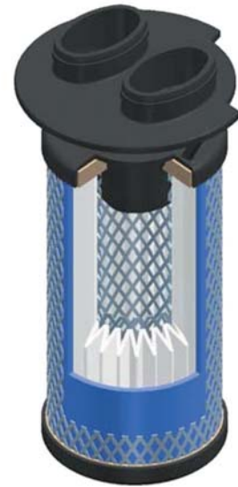
Cross section of the depth filter

By utilising various filtration mechanisms such as retention by direct impact, sieve effect and diffusion effect, liquid aerosols and solid particles down to the size of 0.01µm are being retained in the filter.