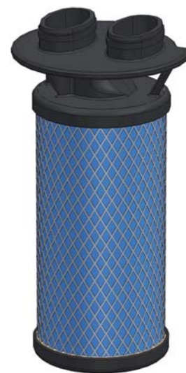
Depth Filter UltraPleat® M